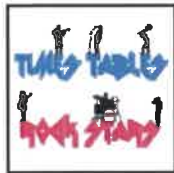
Times Tables Rock Stars